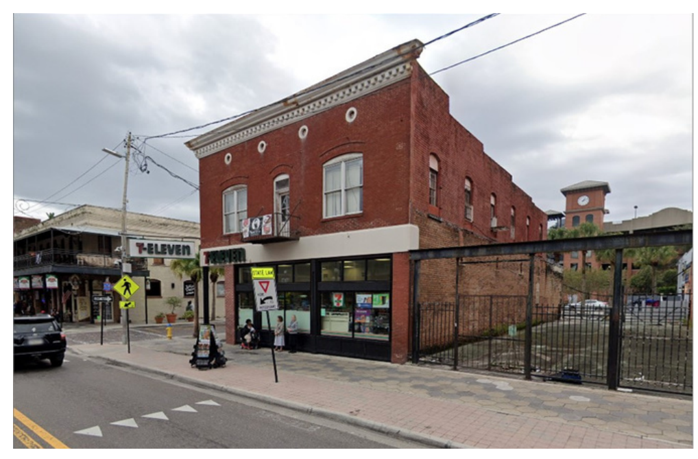
Rapidly growing area with approximately 49,560 homes within a 3 mile-radius of this property